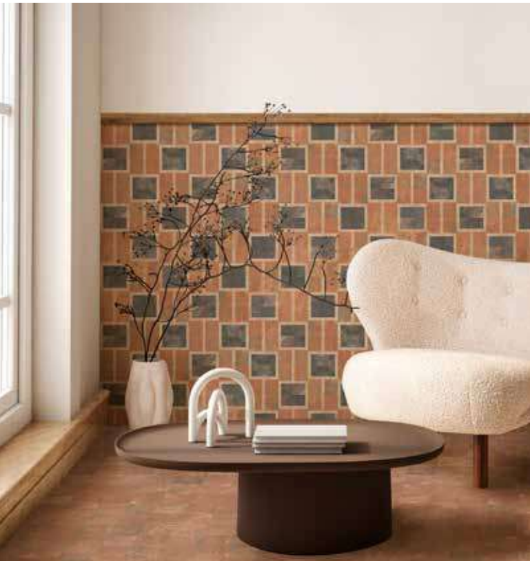
TERRA - Claudia - Burnt Arcilla - 11,5x11,5 cm / 4 1/2" x 4 1/2"

Indoor - outdoor porcelain; home, pool and garden collection for walls and floors.