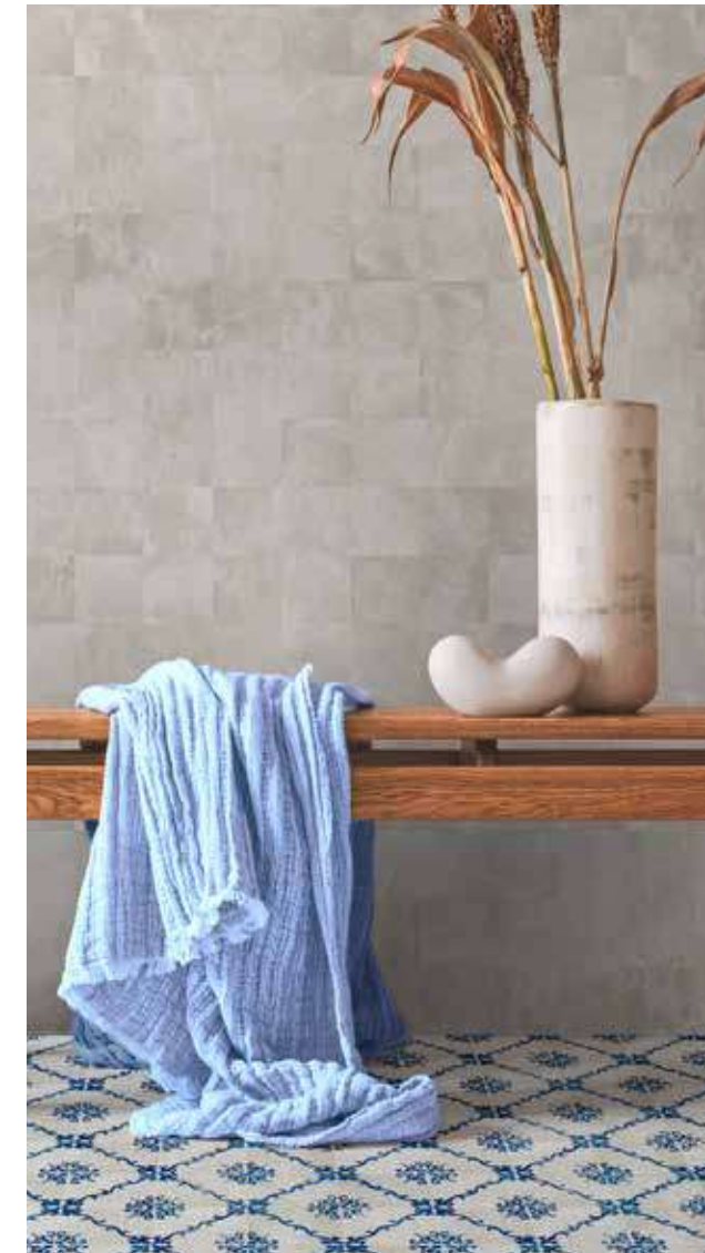
TERRA - Evelina - Atelier White - 11,5x11,5 cm / 4 1/2" x 4 1/2"