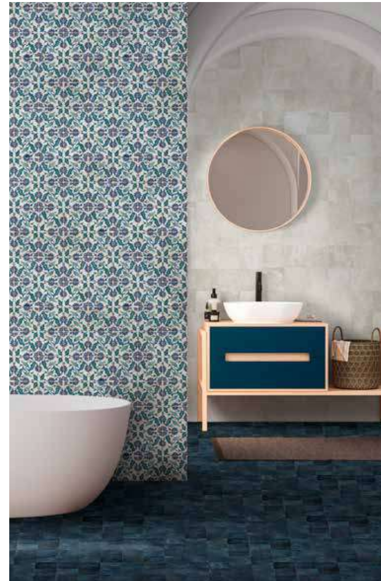
TERRA - Valentina - Blue Clay - Atelier White - 11,5x11,5 cm / 4 1/2" x 4 1/2"