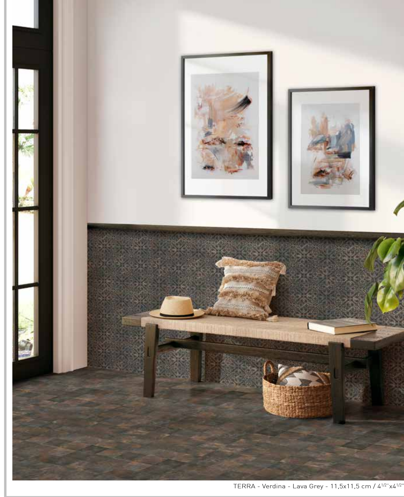
TERRA - Verdina - Lava Grey - 11,5x11,5 cm / 4 1/2" x 4 1/2"