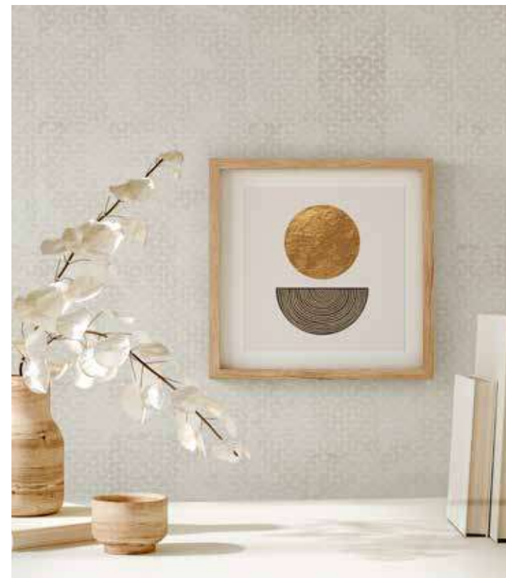
TERRA - Audra - 11,5x11,5 cm / 4 1/2" x 4 1/2"