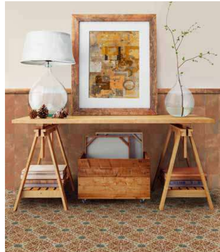
TERRA - Greta - Burnt Arcilla - 11,5x11,5 cm / 4 1/2" x 4 1/2"