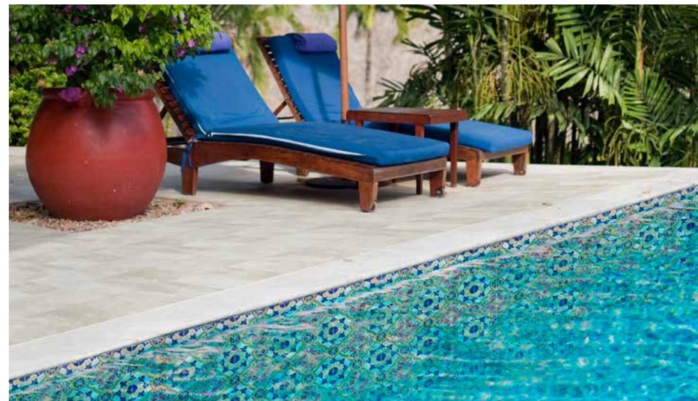
TERRA - Milana - 11,5x11,5 cm / 4 1/2" x 4 1/2"