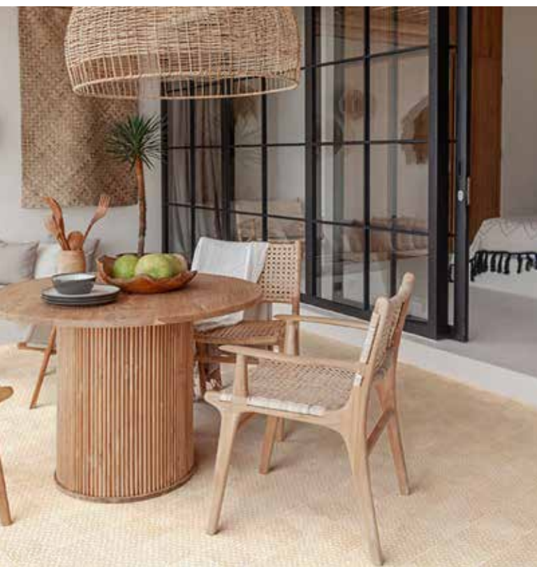
TERRA - Veneta - 11,5x11,5 cm / 4 1/2" x 4 1/2"